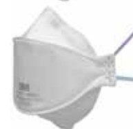
3M™ Aura™ Health Care Particulate Respirator 1862+