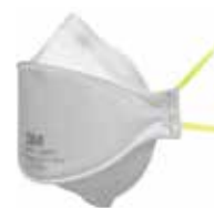
3M™ Aura™ Health Care Particulate Respirator 1861+