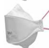
3M™ Aura™ Health Care Particulate Respirator 1863+