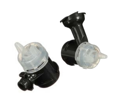
With quick-change replaceable atomizing heads ranging from 1.1 to 2.0, it's like getting a brand new spray gun with every new nozzle.