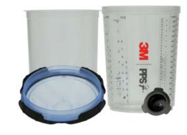
All-in-one disposable solution for measuring, mixing, filtering and spraying of paint materials.