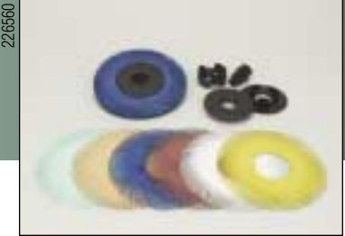
2" and 3" Radial Bristle Discs, T-C