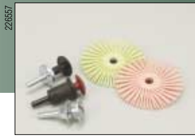
SR Radial Bristle Discs