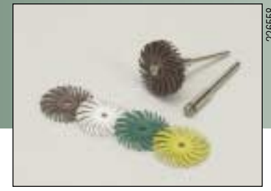
1" Radial Bristle Disc