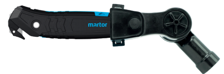
SECUMAX 150 WITH CONNECTOR