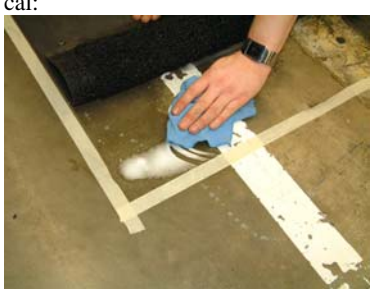
4- apply tape and press with rubber